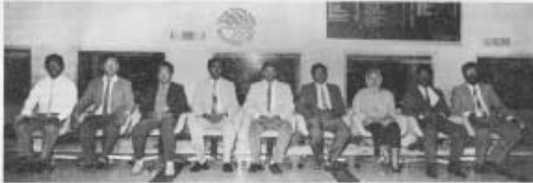
Council members present during the first meeting

In 1986, as industry, in particular aquaculture in Malaysia was growing fast, a group of professionals from industry, academia and government got together to unite and assist in this development. The Malaysian Fisheries Society as a professional society which was officially registered on 13th August 1987.