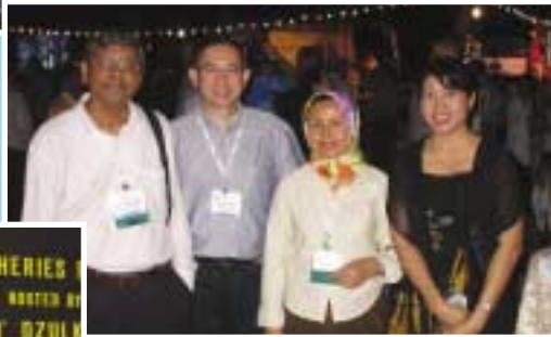
WAS Bali 2005