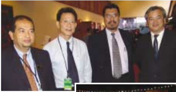
Asian Aquafeeds, Kuala Lumpur 2005

The Society promote its objectives through seminars, workshops and collaborative studies and activities. Since its inception, MFS has covered aspects from angling fisheries to the ornamental industry.