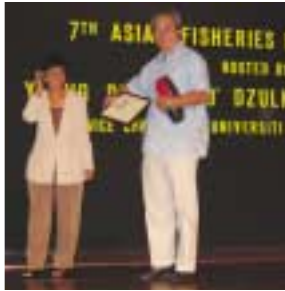
Asian Fisheries Forum, Penang 2005

The Society communicates its vision and objectives through various channels which have been conducted on a regular basis.